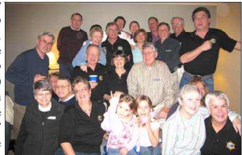
Still More Bedtime For Bozos