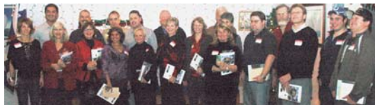
The Fall '07 Graduating Class