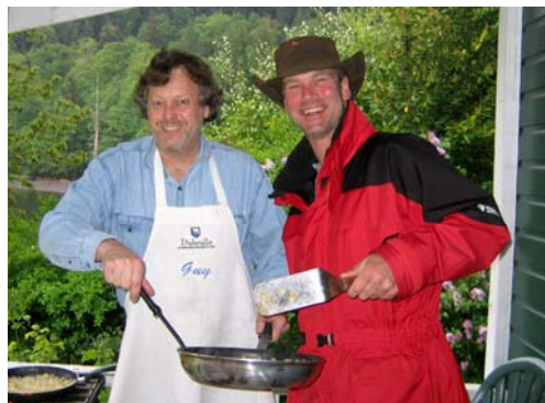
Our Commander, their Cruisemaster

The meal festivities - the Saturday Night Pot Luck Dinner, the Sunday Commanders’ Breakfast and the Sunday night barbecue - were well attended and enjoyed. The first two meals were held inside the all-purpose group rental cabin, and the barbecue