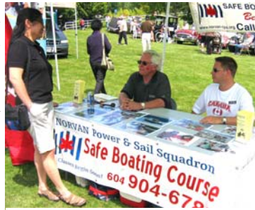
Web and Rob Hustle Alice

July 1 was hot and sunny at North Vancouver's Waterfront Park. The throngs enjoyed the traditional July 1 celebrations including live music, barbeque smokies, a citizenship ceremony, face painting, and numerous booths. Well presented