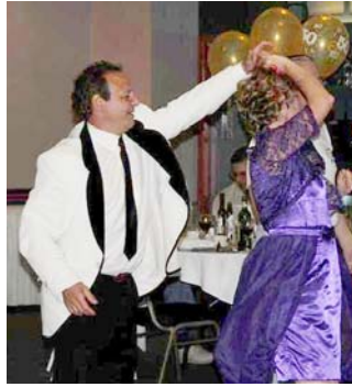
The Surprise Member, Buddy Holly, makes his move and ...