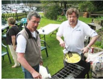
(Someone had a rough night)

According to Norvan legend and tradition, the Norvan Commander must lead a team of ruthless yet brave scallywags to the Union Steamship Marina on Bowen Island on the occasion of the birthday of our glorious Queen Victoria to defend from and fight to the death the reprobate and despicable scoundrels of the Coquitlam Squadron. The ensuing victory celebrations are to last a fortnight. And so we did. Except for the fortnight part - it was two nights. Oh yeah, the fight to the death piece was replaced with brutal yet pleasant Lawn Bowling and Cribbage contests. But we had fun.