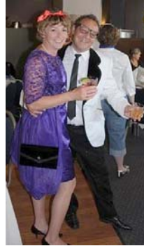
Wins the Man's Best Costume