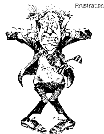
Time to Go

No HA candidates this month, but perhaps no longer my problem, so .. ☼ Sayonara : this is the last issue under the current editorial management. Having informed, bothered and, I hope, amused you since May, 1999, it is probably time to move on, leaving retired almost 1" of fillers and 15 CDs with 500,00 cliparts. Perhaps I will start a new Family Newsletter - my Mom and sister might get a few laughs, although may resent the necessity of having to contribute a monthly column ☼ Parting Gifts : some boating advice, first reported in our January 2001 edition: (1) boating is not dangerous, sinking is dangerous (2) there are 3 rules for properly docking a boat. Unfortunately, no one knows what they are (3) when a forecaster talks about yesterday's weather, he's a historian. When he talks about tomorrow's, he's reading tea leaves (4) a comment about how well things are going is a guarantee of trouble (5) in the old days, boating was dangerous and sex was safe; now it's the other way around (6) a gale is nature's way of saying "up yours" (7) if its lousy here, its probably good where you are going (7) the longer the trip the greater the odds of having engine failure, and (8) any skipper who plays banker when paying the tab for a crew dinner will come out $11 short and be expected to leave a tip ☼ And : that's about it. Cruise carefully, stay safe, and party on!