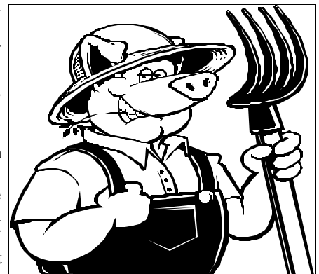
Say, mister, ....