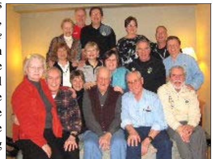
Still More Bedtime For Bozos