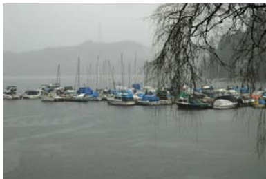
Even the willow weeps

one of the best around as it helps to reinforce the teachings of boat safety and navigation with a real boat on the water.