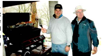
And its their fault

[For those keeping score, 2 of the last 5 Spring Cruises featured rain, 1 was windy, 1 overcast and 1 sunny-Ed.]