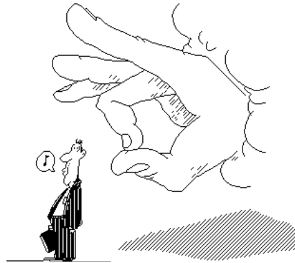
B.C. Boater, Ottawa

Overlooked by these boffins was the recommendation from the local Committee that considered the proposed regulations, that "the