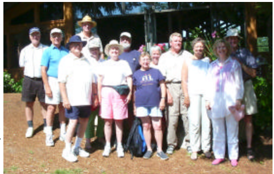
Participants in Ugliest Knees contest

vantage of the juice, coffee and muffins at the pavilion before setting off for their next destination. All in all a great weekend ... sorry so many missed it.