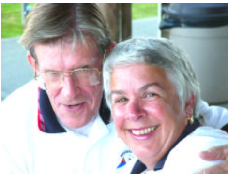
Here we go a Car(r)olling