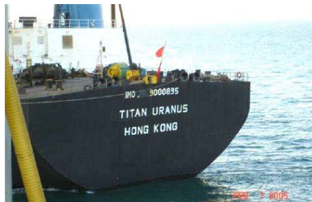
[Some pictures you just can't pass up]