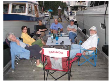
Dinner on the Dock with Bellevue Telegraph Harbour